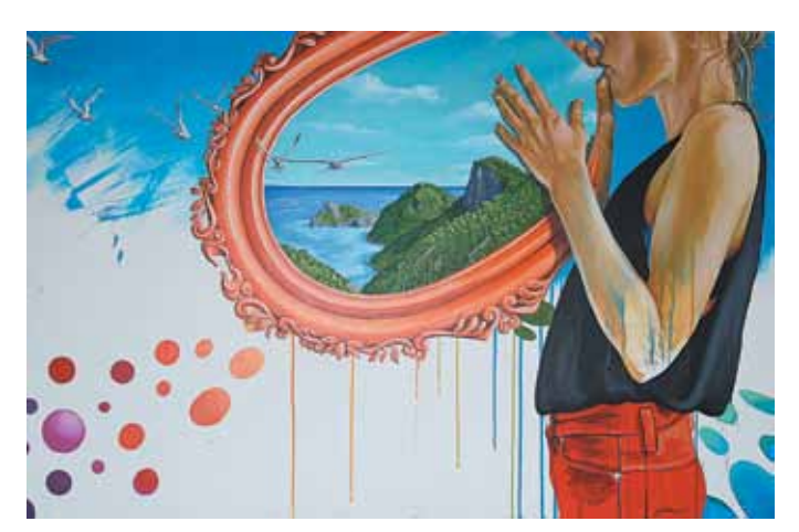
Taking in the clean air - acylic on board. 0000 x 0000mm.