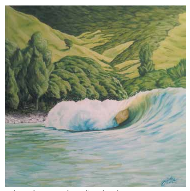
Delaware bar (cropped) - acylic on board. 0000 x 0000mm.