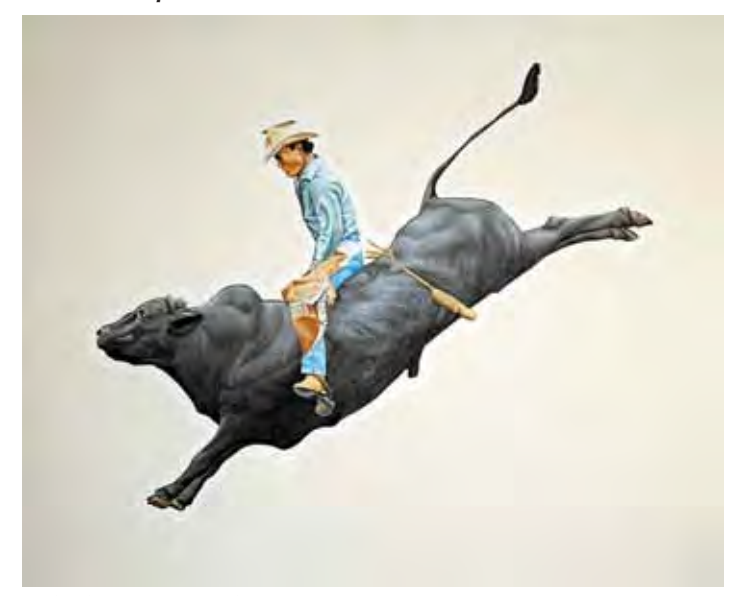
Bullrider 2013 - acylic on board. 0000 x 0000mm.