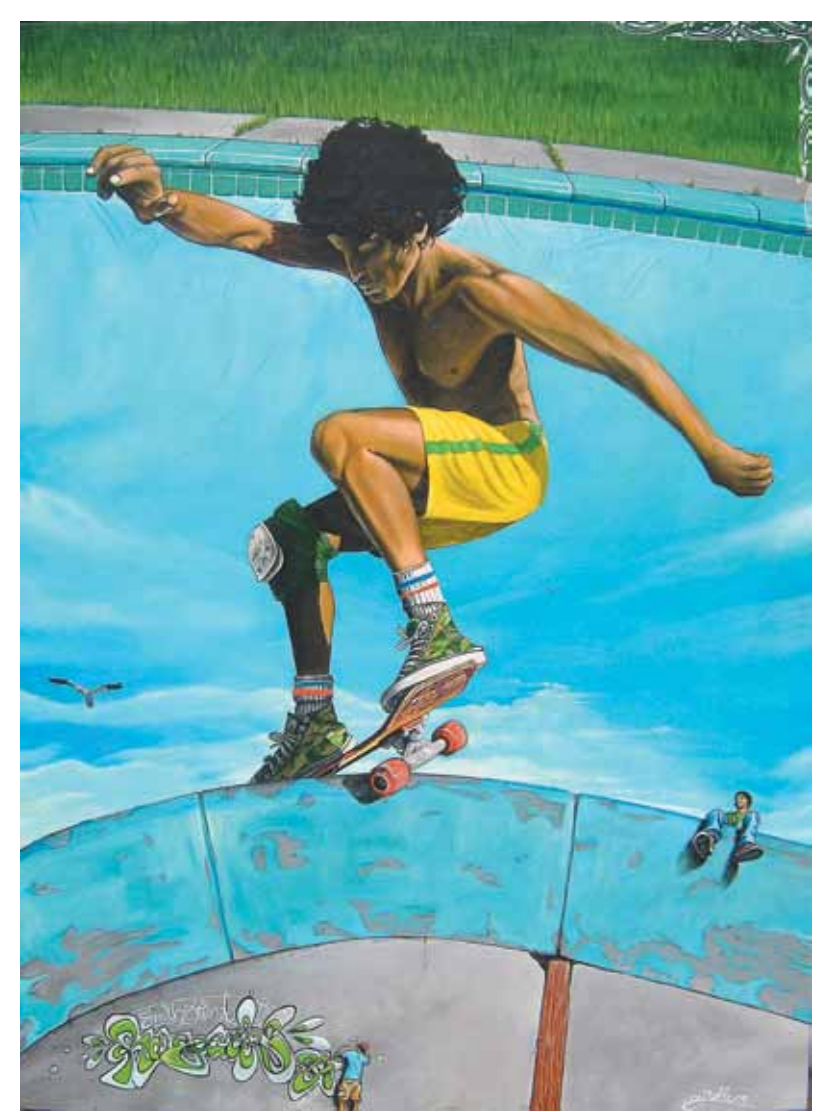
Rowgowski 2008 - acrylic on board. 800 x 400mm.

I aim to paint bright bold paintings to create a joyful mood within the piece."