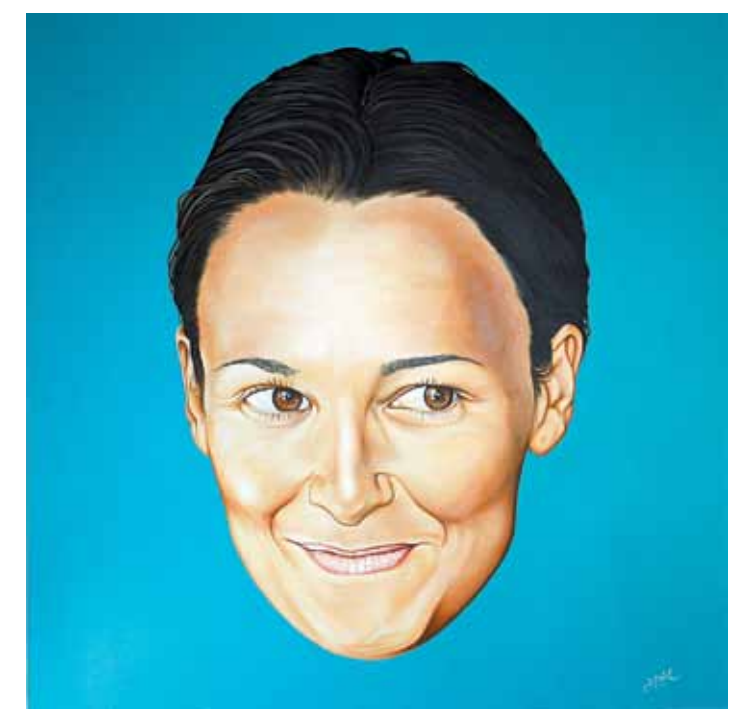
Astrid 2014 - acylic on board. 1200 x 1200mm. Winner of the 'Lisa Grennell - Top of the South Award'.