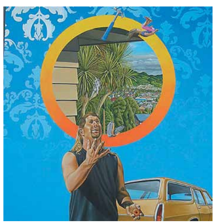
The Juggle - acylic on board. 1200 x 1200mm.

With a passion for capturing movement, Geoff describes himself as a process driven artist that endeavours to create work that is beautiful and technically profound to a high standard. "I like to combine different applications to create a tension in the work. I enjoy using the figurative form and natural subjects to tell stories of environmental, social, and political narrative.