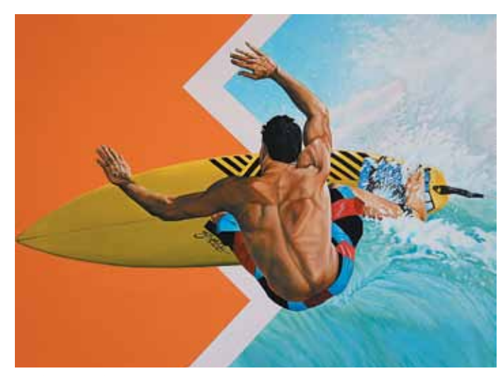
Parko - acylic on board. 0000 x 0000mm.

"My subject varies widely including social politics, NZ culture, environmental comments, music and sports.